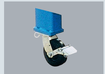
Caster Frame Assembly